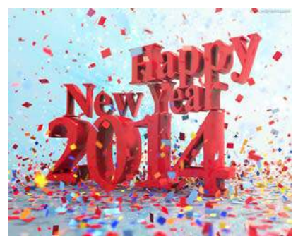
Ring in the New Year